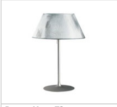
Romeo Moon T2 design by Philippe Starck

Table/desk lamp providing diffused light