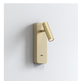
CODE: 1058156 FINISH: MATT GOLD