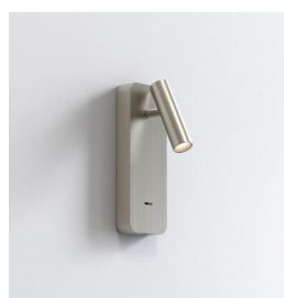
CODE: 1058155 FINISH: MATT NICKEL