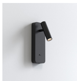
CODE: 1058153 FINISH: MATT BLACK