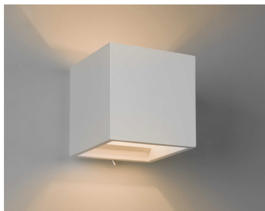
CODE: 1196004 FINISH: PLASTER

TO MAINTAIN THIS PRODUCT TO ITS BEST CONDITION, PLEASE VIEW OUR CARE AND CLEANING GUIDE ON THE SUPPORT SECTION OF THE ASTRO WEBSITE.