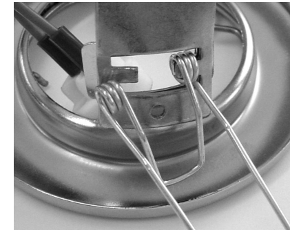
Assembling the spring and stirrup

Assembling the light fitting into the adapter plate: Note the position of the short arm of the retaining spring inside the plate