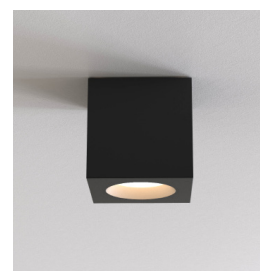
CODE: 1326044 FINISH: TEXTURED BLACK