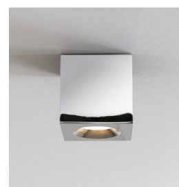
CODE: 1326046 FINISH: POLISHED CHROME

THIS PRODUCT IS NOT SUITABLE FOR INSTALLATION WITHIN FIVE MILES OF THE COAST. FOR THESE ENVIRONMENTS, PLEASE FILTER PRODUCTS ON THE ASTRO WEBSITE BY 'COASTAL'.