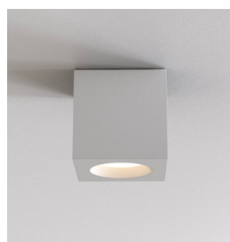
CODE: 1326043 FINISH: MATT WHITE