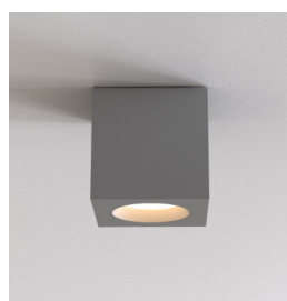
CODE: 1326045 FINISH: TEXTURED GREY