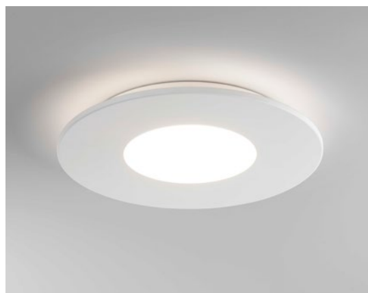
CODE: 1382002 FINISH: MATT WHITE

TO MAINTAIN THIS PRODUCT TO ITS BEST CONDITION, PLEASE VIEW OUR CARE AND CLEANING GUIDE ON THE SUPPORT SECTION OF THE ASTRO WEBSITE.