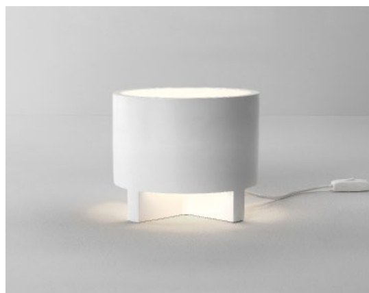
CODE: 1395002 (8300) FINISH: PLASTER

TO MAINTAIN THIS PRODUCT TO ITS BEST CONDITION, PLEASE VIEW OUR CARE AND CLEANING GUIDE ON THE SUPPORT SECTION OF THE ASTRO WEBSITE.