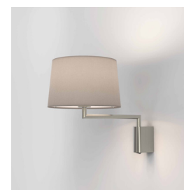
CODE: 1404002 (8563) FINISH: MATT NICKEL