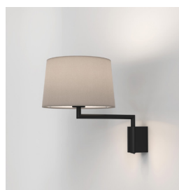
CODE: 1404001 (8562) FINISH: MATT BLACK