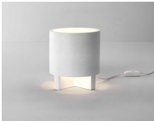
CODE: 1395001 (8115) FINISH: PLASTER

TO MAINTAIN THIS PRODUCT TO ITS BEST CONDITION, PLEASE VIEW OUR CARE AND CLEANING GUIDE ON THE SUPPORT SECTION OF THE ASTRO WEBSITE.