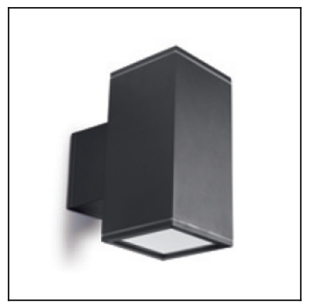
The photograph may not match the reference exactly. Please read the product description to identify the finish.